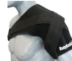
Body Assist - Sports Thermal Various sizes available