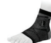
Elastic Ankle Strap Various sizes available