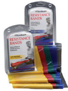
TheraBand Retail Pack Various strengths available