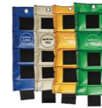
Soft Ankle/Wrist Weights Various weights available