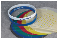
TheraBand Hand Trainer Various strengths available