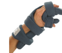
Rolyan Hand Splints Various sizes available