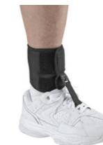
Ankle Foot Orthosis Various sizes available