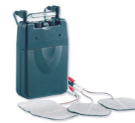
TENS Unit - Digital with Electrodes & Leads FPP315210