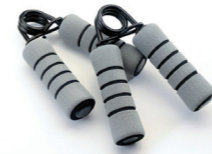
Hand Grips Various strengths available