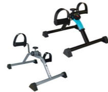
Aspire Exy Pedal FPP292800 - Manual FPP292810 - Digital