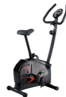
Resistance Level Exercise Bike FPF290610