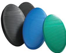
Theraband Stability Trainer Various strengths available