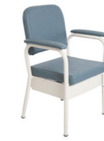
Aspire Bedside Commodes BEC045115 - Champagne BEC045116 - Slate SWL 160kg