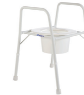
Aspire Over Toilet Aids Various sizes available