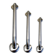
Grab Rail Anti Slip Various sizes and colours available