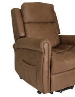
Aspire Raphael Quattro Lift Recline Chair Various sizes and accessories to suit individual requirements