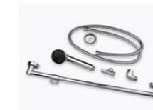
Hand Held Shower on Rail BTS107500