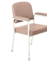
Aspire Low Back Classic Day Chair CHP208000 - Champagne Vinyl CHP208005 - Slate Vinyl SWL 160kg