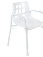
Aspire Shower Chairs Various sizes available