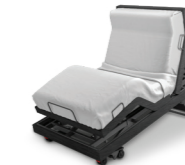
Aspire ComfiMotion Activ Care Bed Various sizes available