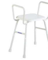
Aspire Shower Stools Various sizes available